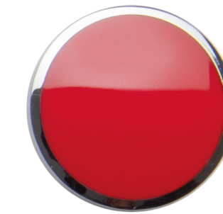
granada red NEW P186C