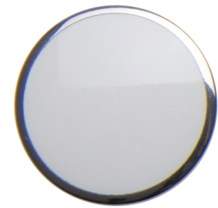
organic white P7541C