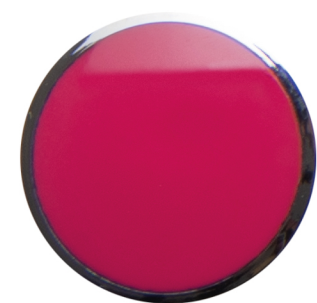
lakota pink NEW P205C