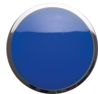
vitrol blue P2728C