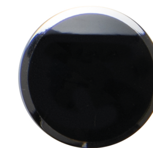
onyx black P447C