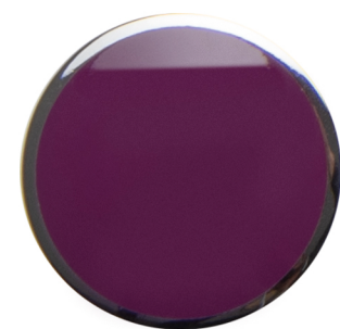
persian violet P260C