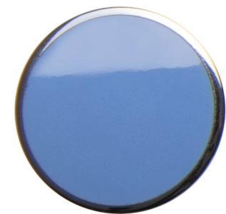
columbia blue NEW P7451C