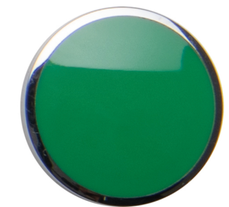
lotus green RAL 6032