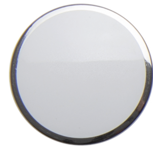
deep white P7541C