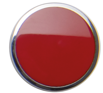
zircon red P187C