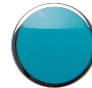
inca turquoise NEW P7710C