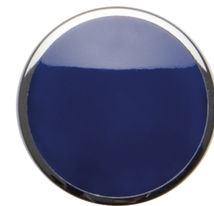
arizona blue P269C