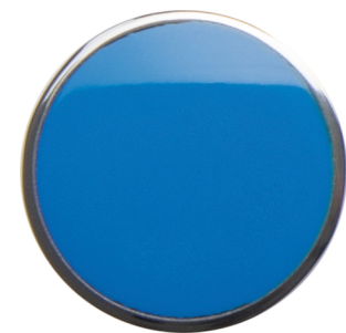
coral blue P2925C