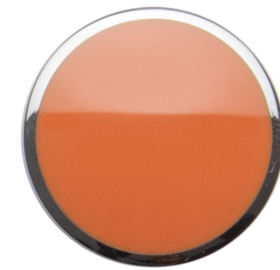
oriental orange P1575C