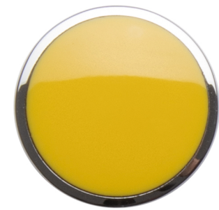
indian yellow P109C